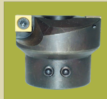
■ FIXED CUTTER See above for sizes.